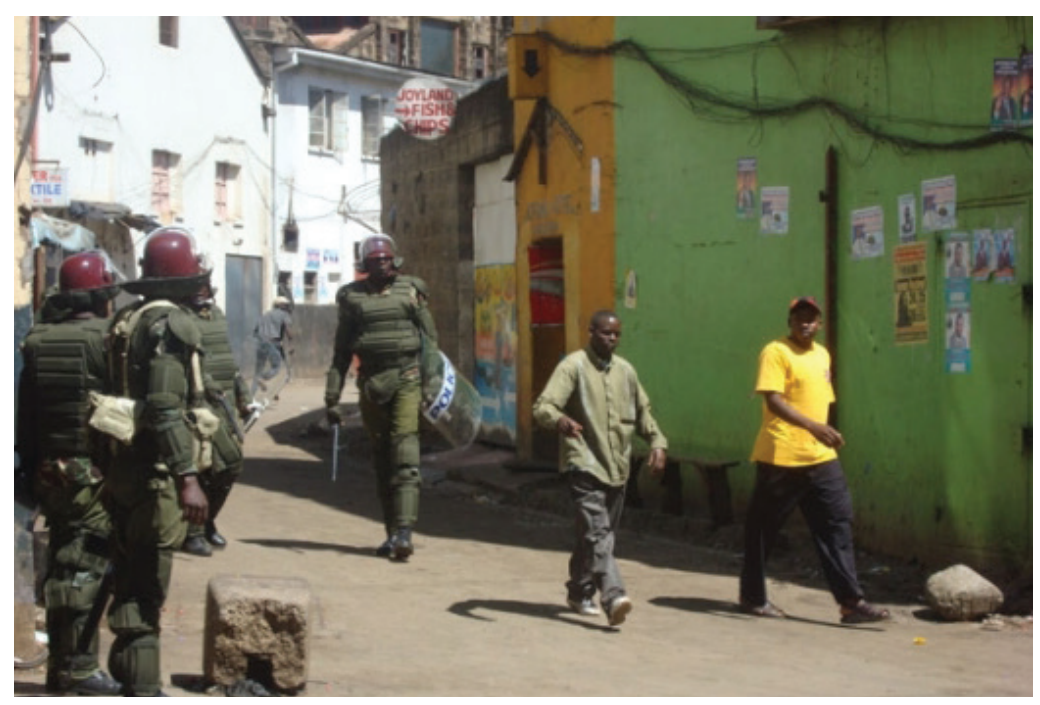
Police on the streets during election violence, January 2008

The NPSC's vetting process is part of efforts to reform Kenya's National Police Service, including by removing human rights violators from its rank and file and increasing the trustworthiness and accountability of the police service. The number of police officers to be vetted is approximately 77,500.<sup>11</sup> As of December 2016, the NPSC had vetted approximately 2,470;<sup>12</sup> the current number remains unclear.<sup>13</sup>