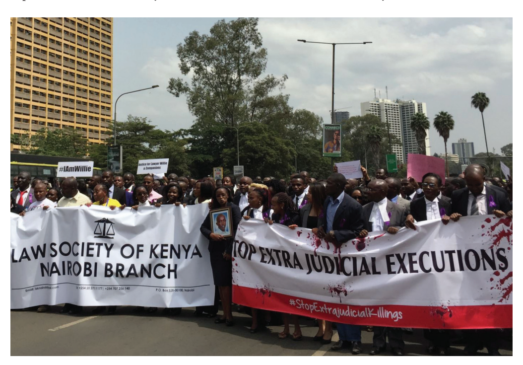
Kenyans, including human rights activists, lawyers, and taxi operators, peacefully protest in Nairobi against alleged pervasive killings and enforced disappearances linked to police, July 2016.

The blanket exclusion of the media is unjustifiable, unreasonable, and unconstitutional unless the legal (and security) reasons for the exclusion are explained. Yet, when questioned as to why it had excluded media, the NPSC failed to give a reasonable explanation, arguing that excluding media was the result of logistical challenges.<sup>27</sup> This contradicts another explanation, from February 2017, that it was due to national security.<sup>28</sup>